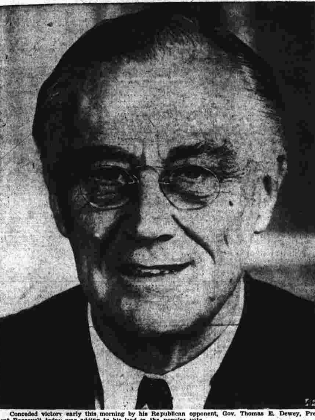
Conceded victory early this morning by his Republican opponent, Gov. Thomas E. Dewey, President Roosevelt today was adding to his lead in the popular vote.